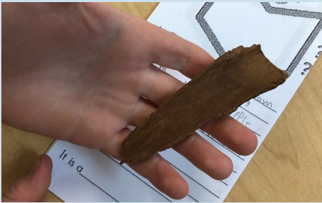
A piece of cinnamon tree bark.