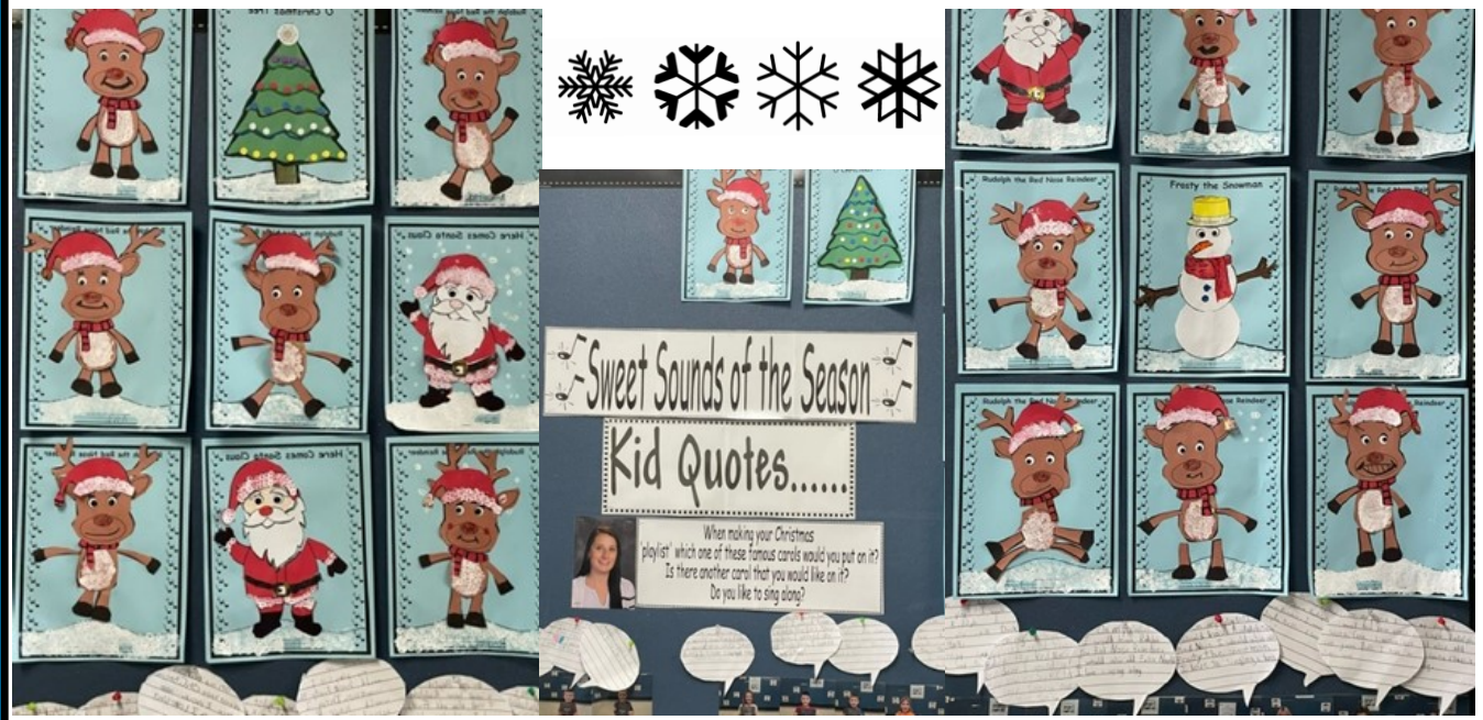
Reindeers by Grades 2-3