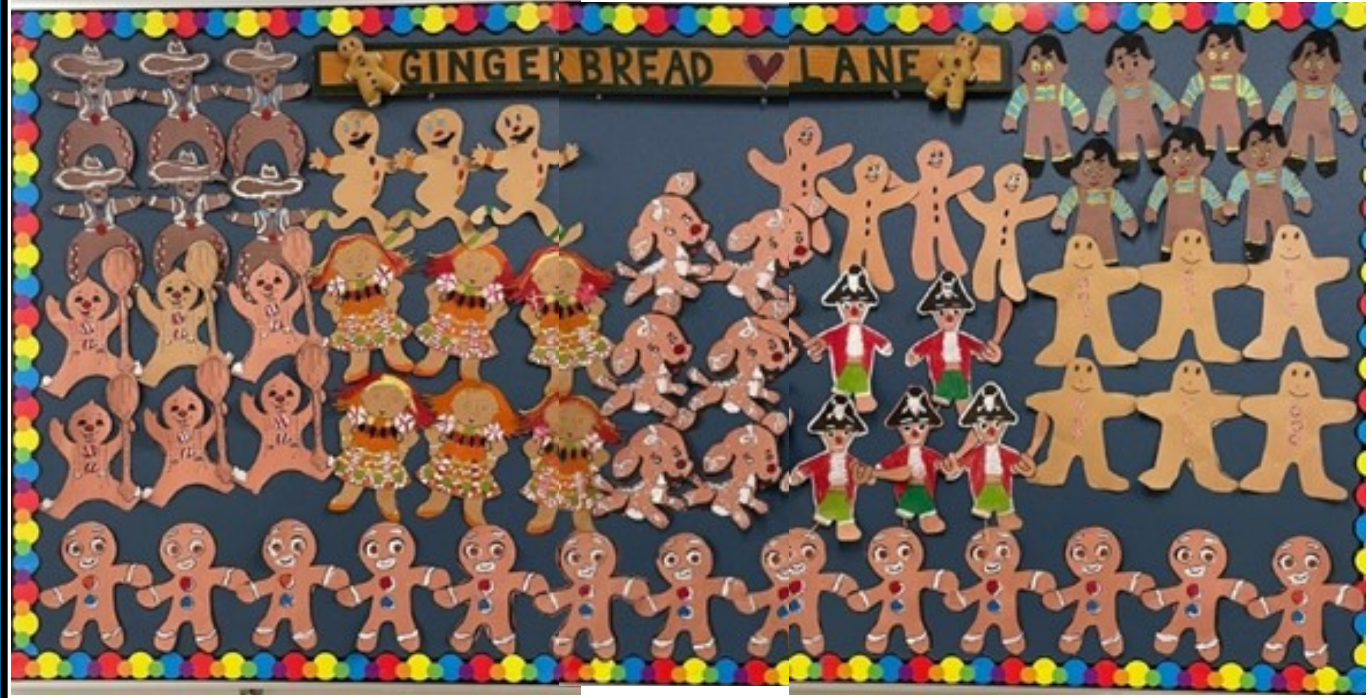
Gingerbread Lane by Grade K-1