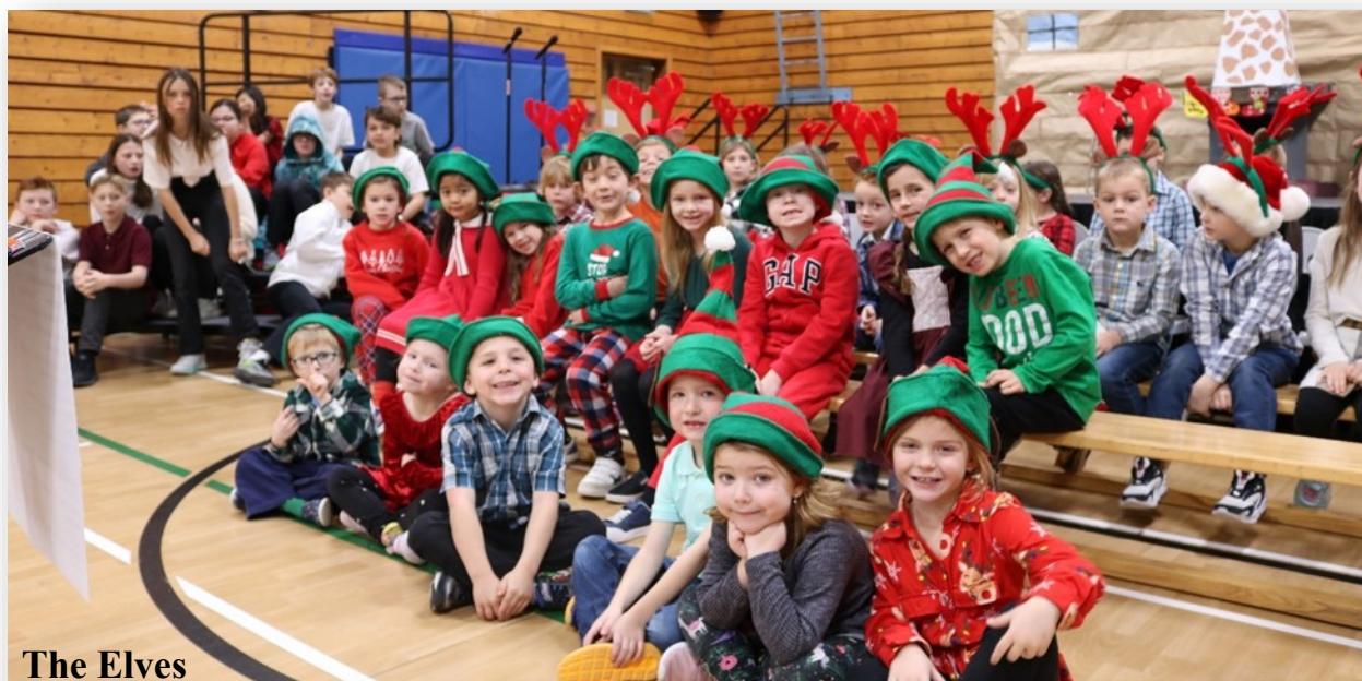
The Elves and Reindeer