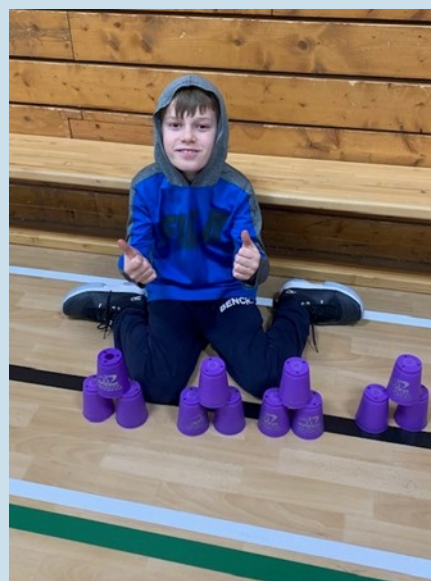
Speed Stacking fun!