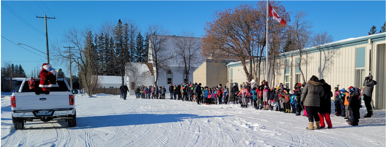
Santa singing Christmas Carols with the students at Balmoral School.