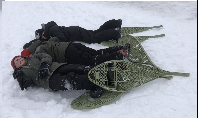
We all go tumbling down!